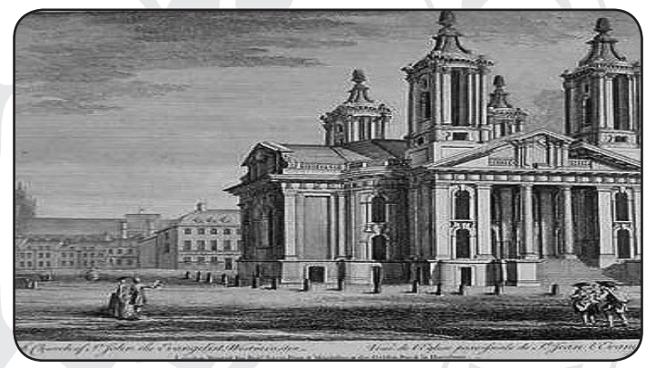
St. John's Smith Square 18th Century Engraving

expanding geographical spread of London. The Commission did not achieve its target, but did build a number of churches, known as Queen Anne Churches. St. John's, Smith Square is one, completed in 1728.