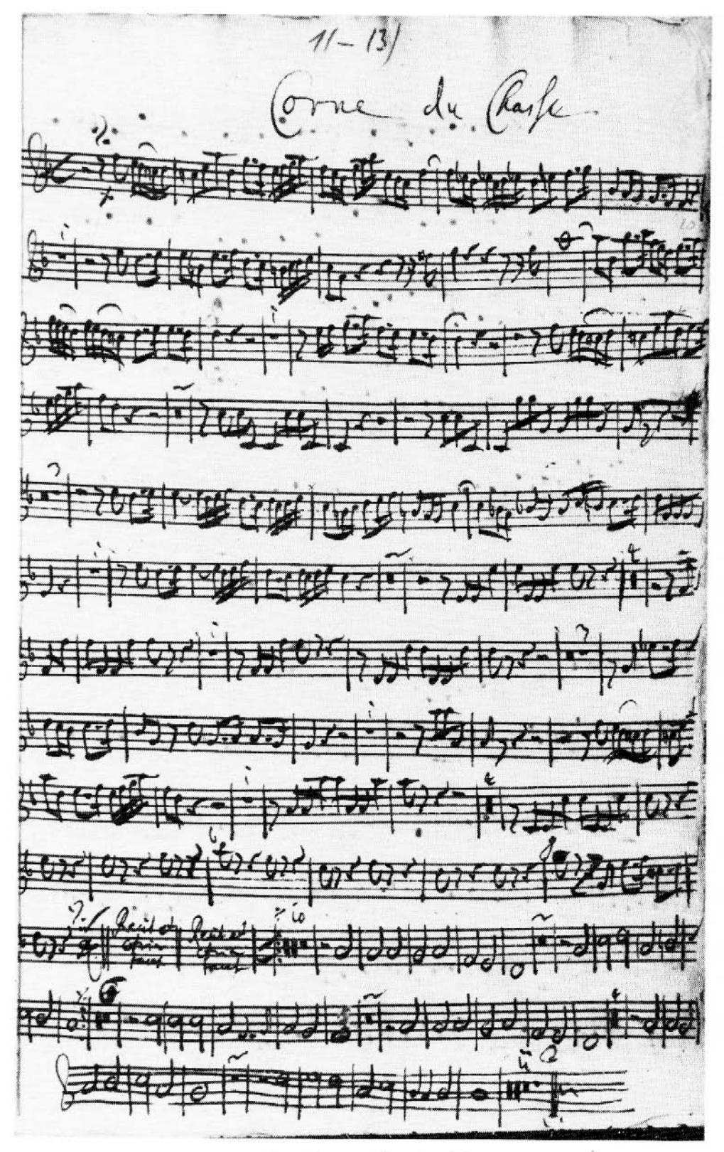
Bach's own handwriting BWV 109 Corne du chasse, Staatsbibliothek zu Berlin, Mus. ms. Bach St 56