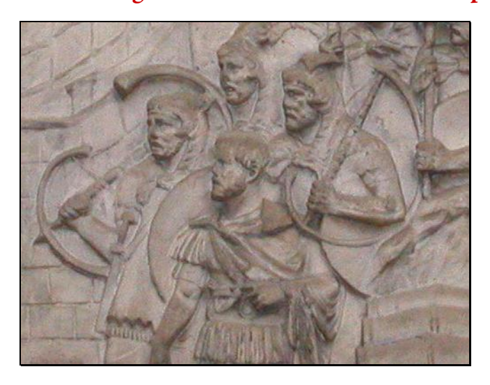
Detail of Trajan's column in Rome: Cornu players in a triumphal procession