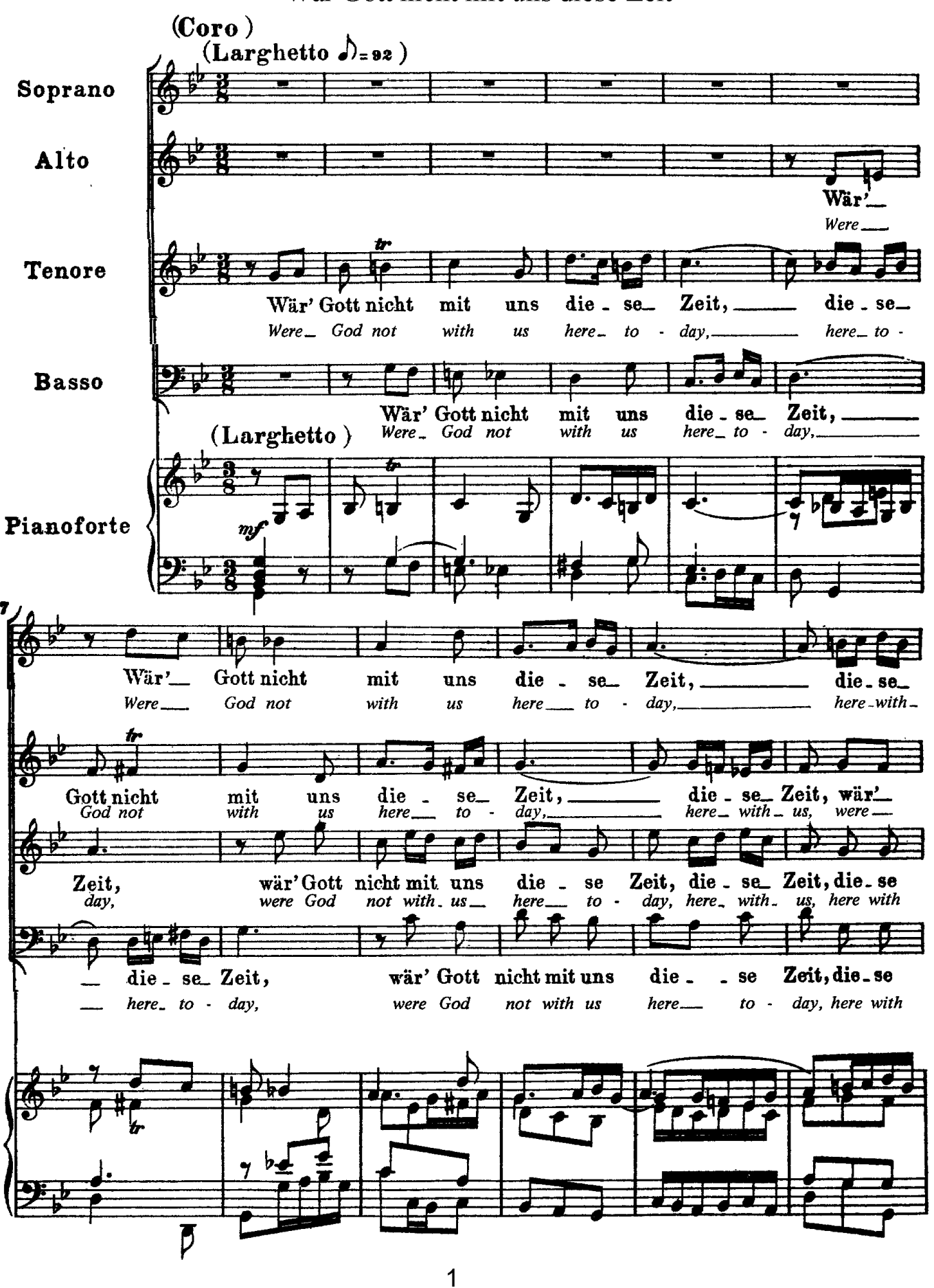
J.S. Bach Cantata No. 14 Wär Gott nicht mit uns diese Zeit