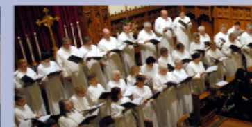
Grace Lutheran Church Choir