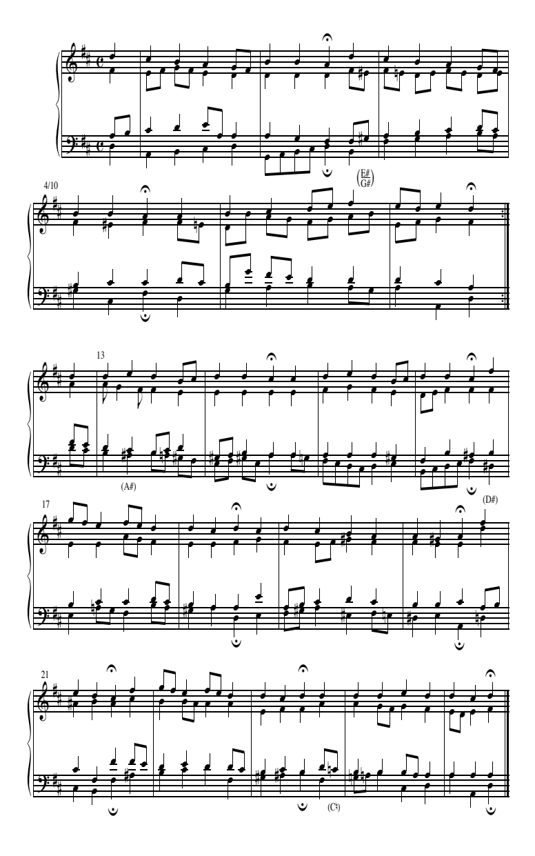
Example 3: "Herzlich lieb hab ich dich, o Herr," BWV 174/5; keyboard reduction-text and basso continuo have been omitted.

Interestingly, when Bach harmonized this chorale melody again, to the text "Ach Herr, laß dein lieb Engelein" in the cantata Man singet mit Freuden vom Sieg , BWV 149, he similarly employed a gradual unfolding of the chromatic aggregate, but without a purely diatonic coda: the aggre-