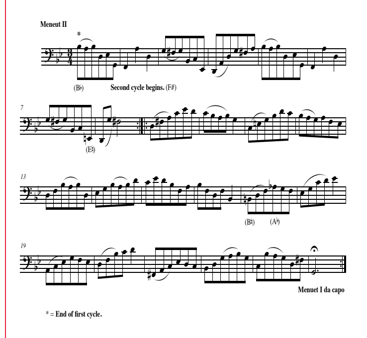
Example 8b: Menuet II, BWV 1007/6