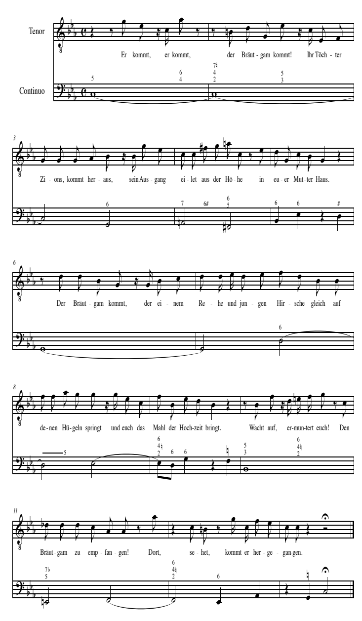
Example 5: "Er kommt, er kommt, der Bräutgam kommt," BWV 140/2.

It is also fascinating to observe that later in this cantata, in the fourth-movement chorale setting for tenor, "Zion hört die Wächter singen," there is a similar single unfolding of the aggregate. The final chromatic tone to appear in this E\flat -major movement is D\flat in m. 71. The remaining three measures, again, are diatonic.<sup>5</sup>