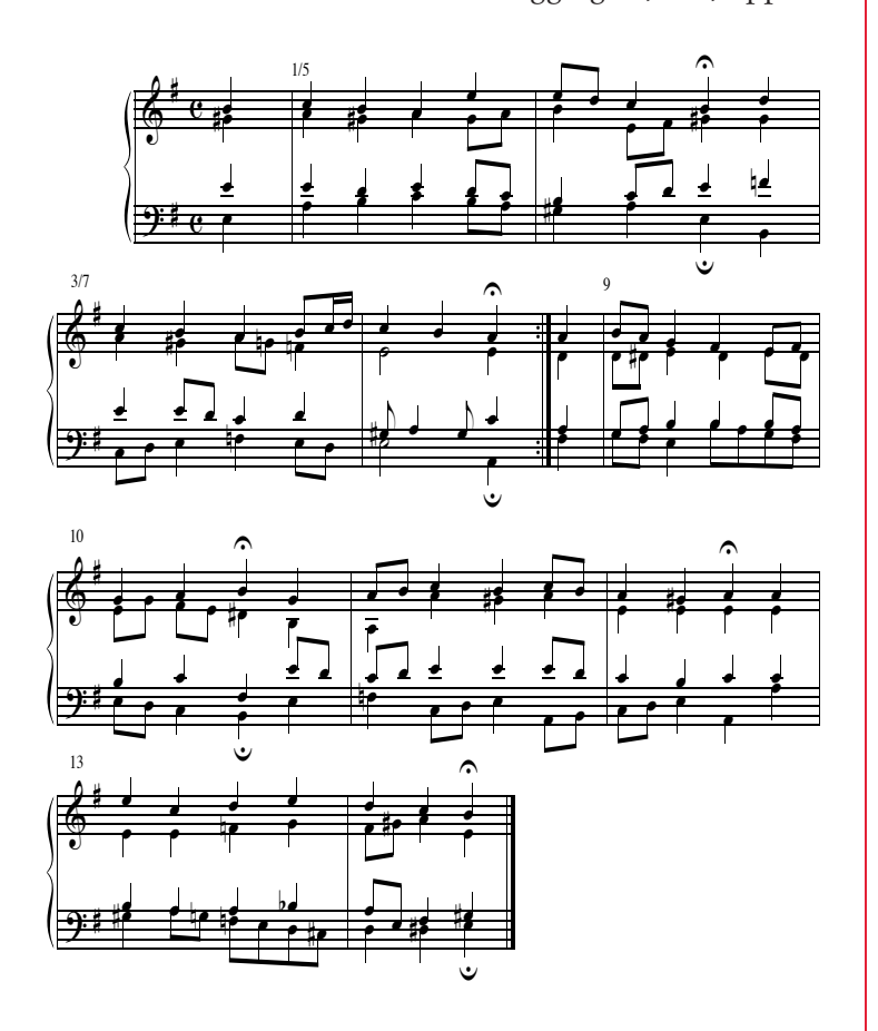
Example 4: "Schau, lieber Gott, wie meine Feind," BWV 153/1; keyboard reduction-text and basso continuo have been omitted.

Many of Bach's recitatives display similar features of chromatic completion. Consider, for example, "Er kommt, er kommt, der Bräutgam kommt," the first recitative of Wachet auf, ruft uns die Stimme , BWV 140, which is in C minor and thirteen measures long (see Examaple 5). The last constituent of the chromatic aggregate, Db, appears