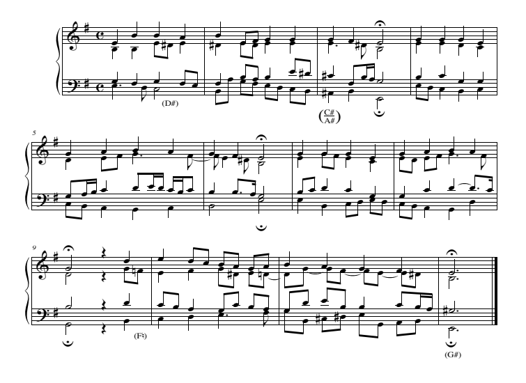
Example 2: Jesus Christus, unser Heiland, BWV 363.

Since chorales are short and their cycles easily observed, the first evidence of chromatic completion in Bach's music is presented from this group of compositions. Not only is the cycle easily observed in these works but its unfolding precisely parallels the unfolding of the composition: the chromatic aggregate is completed near the end of the chorale—often in the very last measure—and no further chromaticism follows. A straightforward example of this design is seen in the E-minor chorale Jesus Christus, unser Heiland , BWV 363. In this work, the "tierce de Picardie" in the twelfth and final measure is also the twelfth member of the aggregate, as indicated in Example 2.