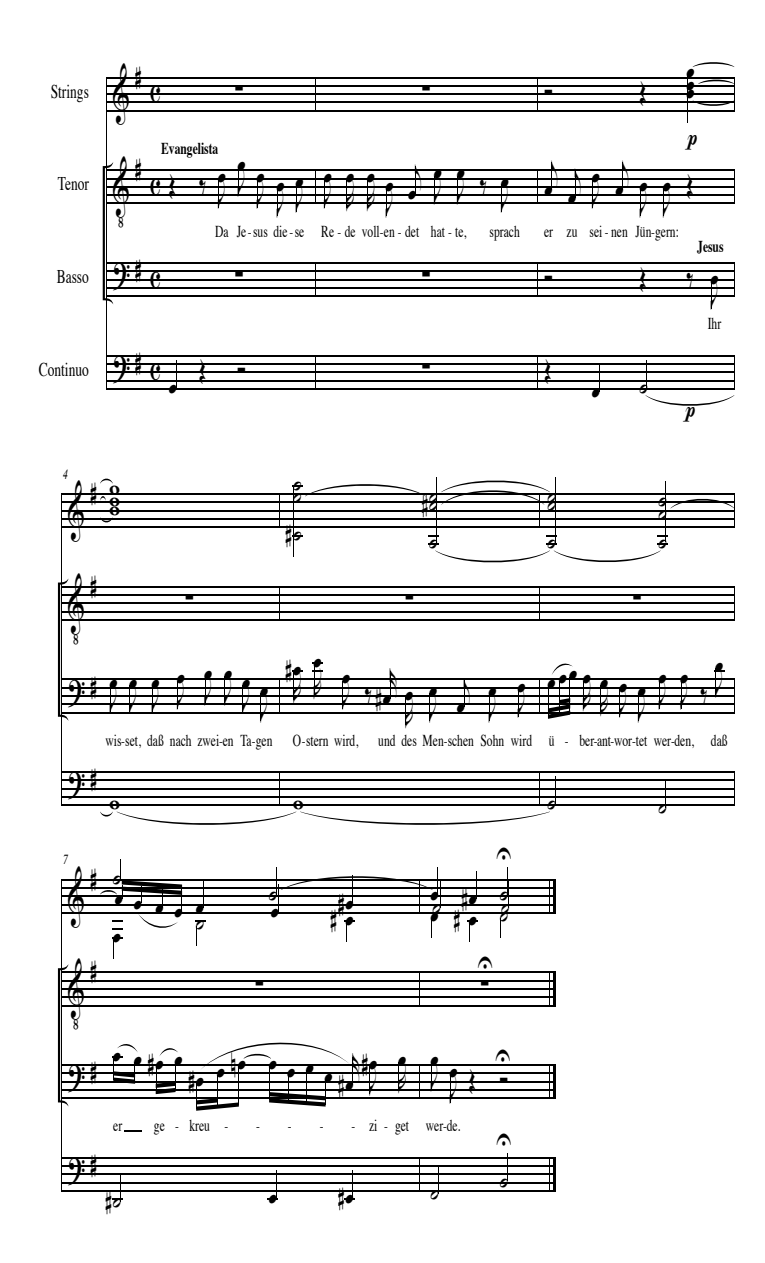
Example 6: "Da Jesus diese Rede vollendet hatte," BWV 244/2; vn I, vn II, and va constitute the "strings" of the upper staff.

In the St. Matthew Passion , several of the recitatives display features congruent with the idea that Bach, however consciously or sub-consciously, associated the completion of a musical form with the completion of the chromatic aggregate. Consider the work's first recitative, "Da Jesus diese Rede vollendet hatte," which is eight measures long and travels tonally from G major to B minor. As may be seen in Example 6, the first chromatic tone to arrive is C #, which is heard in measure five. Two measures later—the penultimate measure—we hear the remaining chromatic tones: D # on the downbeat, A # half a beat later, and then, simultaneously on the fourth beat, E # and G #—thus