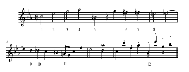
Example 9: Ricercar a 3 from BWV 1079, mm. 1-10.

The situation is similar in the Ricercar a 6, only the B \triangleright now arrives slightly later, as the second pitch in the answering voice. In many other portions of this extraordinary contrapuntal collection, the principle of chromatic completion is equally evident. I give just one further instance. In the Canon a 4 the twelfth (and completing) tone once again is the flatted seventh scale degree, in this case F h. This "missing pitch" arrives just as the second voice enters; it is the sixteenth note in the counterpoint to the newly added voice.