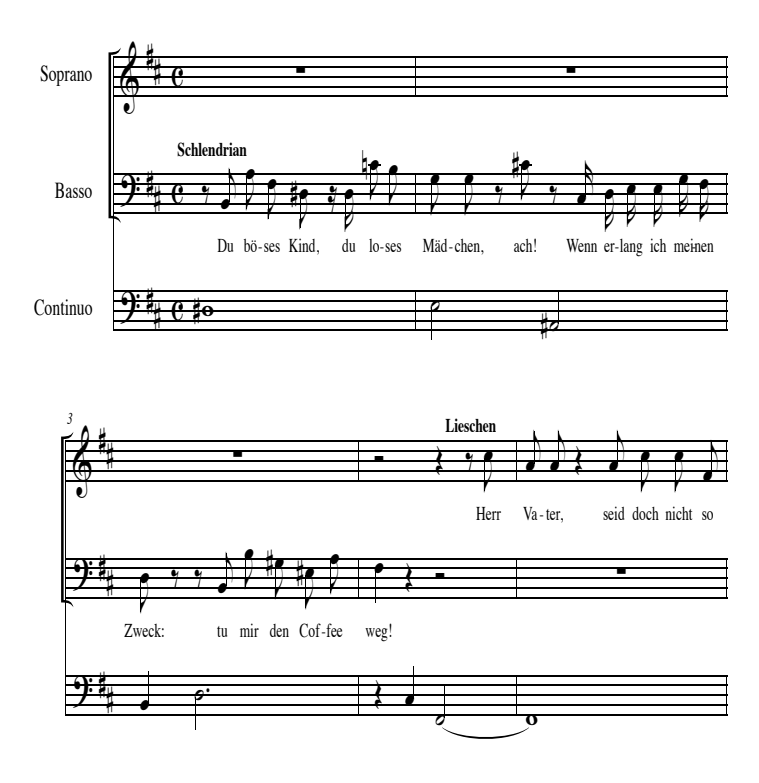
Example 7: "Du böses Kind"/"Herr Vater," BWV 211/3, mm. 1-5.

Chromatic completion is also present in Bach's instrumental music. In the twenty-eight-measure Sarabande