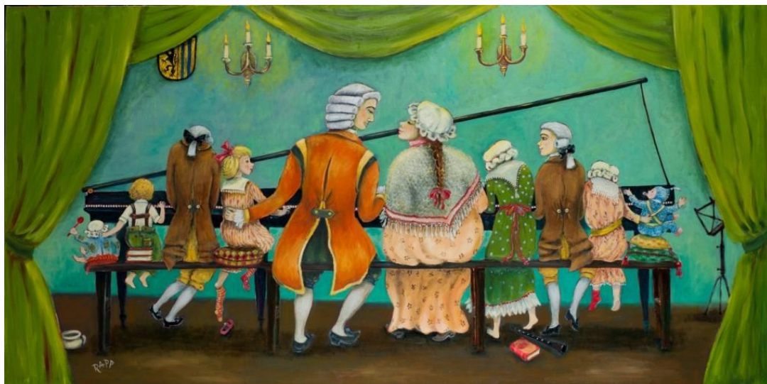
'The Household of Johann Sebastian Bach' Oil on canvas, 180 x 90 cm, 2012

In music and art in general, we are at risk of putting a genius up on a lonely pedestal, forgetting that he was made of flesh and blood. In the case of J.S. Bach, I am convinced that it was particularly his family life that led to his understanding of the human being. He experienced love and loss, birth and death, and every nuance in between.