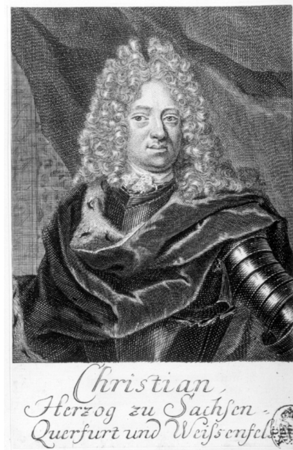
Figure 3. Duke Christian of Saxe-Weissenfels.

Diana claims the first recitative-aria set. She declares that today on the day of Prince Christian's birthday, the day should be his. On this day, Diana is devoting herself totally to hunting in honor of Prince Christian. In the following recitative-aria set, Diana's lover Endymion is disappointed and a bit rejected over Diana's obsession with the hunt. The recitative returns to Diana as she convinces Endymion that she still loves him and that today they must join together in celebrating the hunt for the birthday of Prince Christian. They end the recitative in a charming arioso duet of well-wishing for the day.