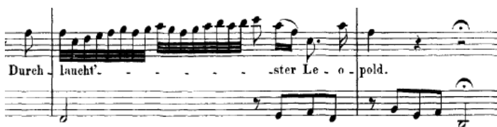
Figure 6. Coloratura on "Durchlauchtster Leopold" in opening recitative from Durchlauchtster Leopold , BWV 173a, by J.S. Bach, mm. 5-7.

The opening movement of Durchlauchtster Leopold is a very high soprano recitative heralding the "Most Illustrious Leopold." 103 Young likens it to a "birthday card message." 104 An amazing coloratura on the words Durchlauchtster Leopold at the end of the recitative (figure 6) immediately signals the importance of the honored guest, Leopold.