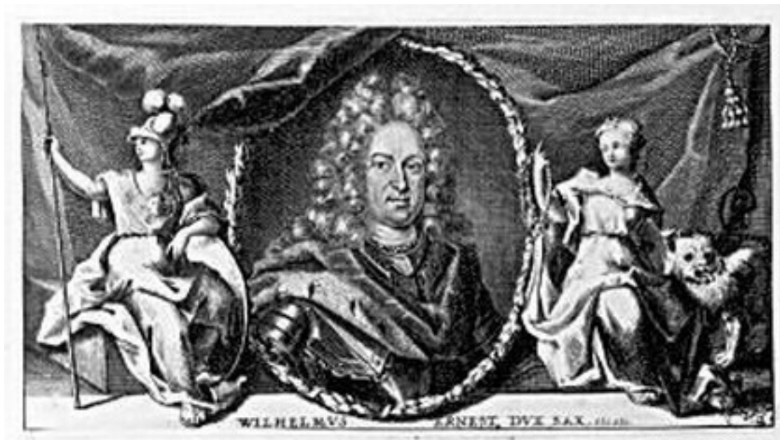
Figure 1. Duke Wilhelm Ernst of Saxe-Weimar, Martin Bernigeroth, engraver.

providing opportunities for his court musicians to study the newest Italian literature. This gave Bach a chance to become familiar with the style of Vivaldi. 33