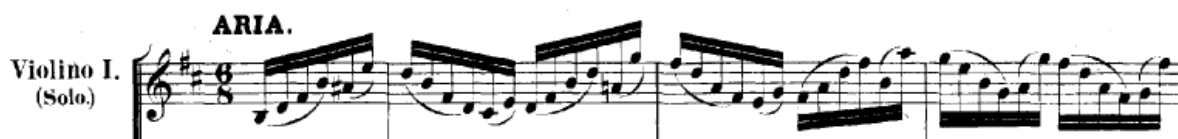
Figure 18. Wave motive in tenor aria "Jede Woge meiner Wellen," from Schleicht, spielende Wellen , BWV 206, by J.S. Bach, mm. 1-4.

aria conveys a spirit of power as it represents one of the main rivers that flow through Saxony. True to Bach's style, the wave motive is presented in the opening measure. The opening B minor chord turns on a tritone to a D major chord and creates a striking balance between the seriousness and intensity of the B minor chord and the and royal sounding D major chord, possibly representing the power of this work for Augustus III (figure 18). This can be felt throughout the aria. The wave motive creates a feeling of rocking on the swelling, rising, and falling waves of the Elbe. In the "B" part of the aria the melody changes but the string part continues with the driving swells.