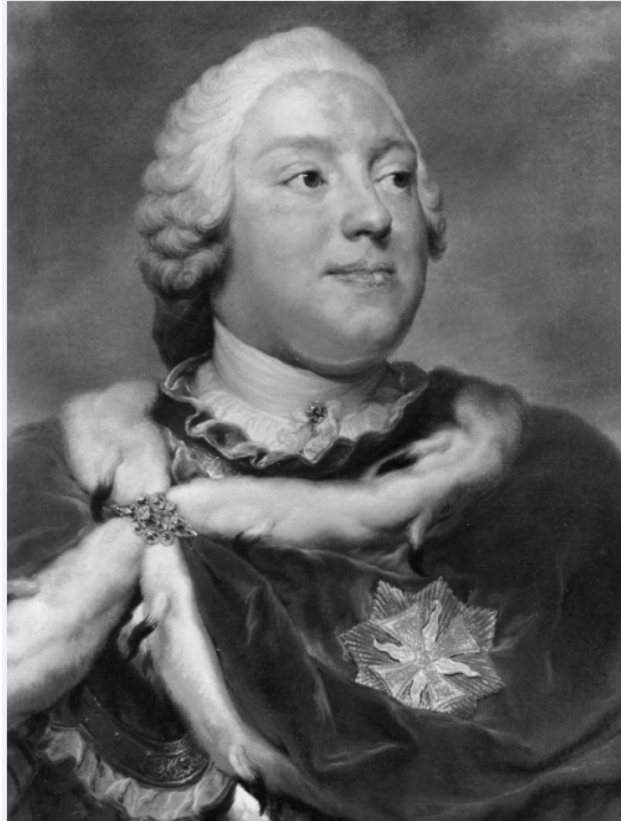
Figure 8. Painting by Anton Raphael Mengs of Prince Friedrich Christian, Crown Prince of Saxony.

after only ten weeks of ruling. In his short life he impacted Saxony as he placed the welfare of his state above his own personal ambitions. 160