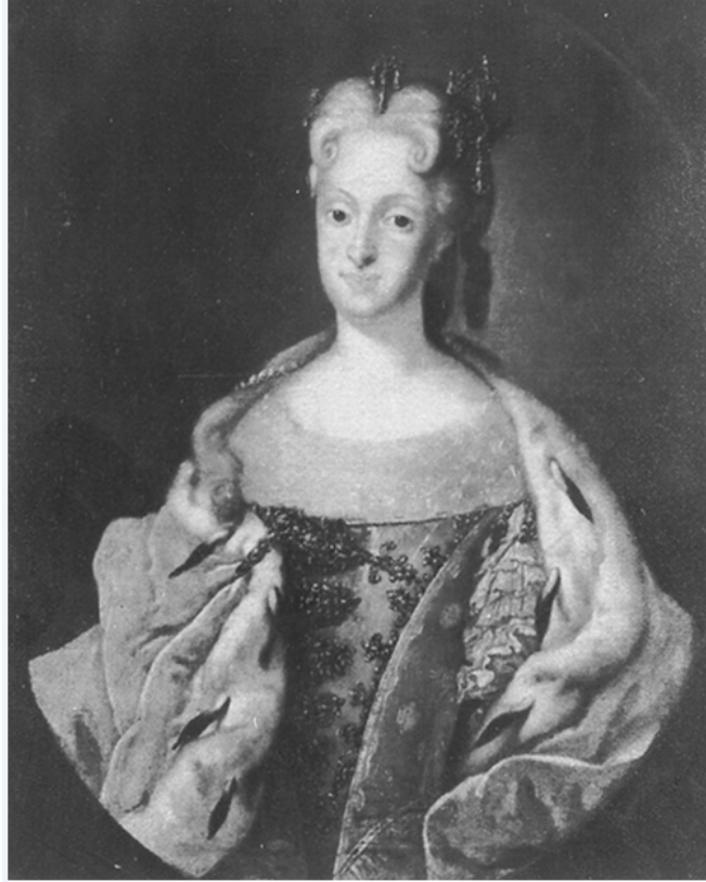
Figure 13. Maria Josepha of the House of Habsburg, Archduchess of Austria, Electress of Saxony, Queen of Poland. Painting by court painter Louis de Silvestre in 1719.