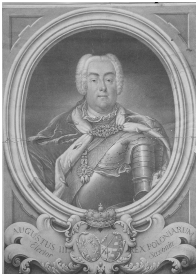
Figure 15. Augustus III, Elector of Saxony, King of Poland.

Augustus III was King of Poland for twenty-seven years. Apparently he liked the title of king more than the actual duties of being a king. He made no attempt to learn the Polish language and reportedly disliked the country itself, spending only two of his twenty-seven year rule there. He left the leadership of the country to some of his royal favorites and corrupt ministers, and maintained his alliance with Russia since he owed Peter the Great help in gaining the throne. 223 The reign of Augustus III and his father are