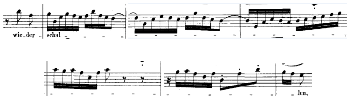
Figure 20. Elaborate vocal passage on wiederschallen in aria “Jede Woge meiner Wellen,” from Schleicht, spielende Wellen , BWV 206, by J.S. Bach, mm. 77- 83.

As the waters of the kingdom swell, Reiches Fluten schwellen , so does the opportunity for vocal virtuosity. In measures 65-67 the allegorical river continues to swell and at measure seventy-seven, a fantastic vocal passage of fifty-two notes, covering nearly six measures is sung by the tenor soloist (figure 20). The word sung to this incredible passage is wiederschallen . Schallen is to ring out and wieder means again. This could be translated with the idea of the name of Augustus ringing out, reverberating, or echoing. Indeed the music reverberates at this point. Again, this passage is placed between two indicators of the waves of the rivers, presenting a picture in music of the waves and swells of the mighty Elbe River.