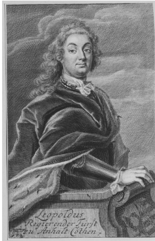
Figure 5. Prince Leopold of Anhalt-Köthen.

The Kapellmeister position for Prince Leopold of Anhalt-Köthen (1694-1728) was perhaps one of Bach's most enjoyable jobs. Due to the resignation of A. R. Stricker, Bach was hired in 1717 by Prince Leopold (figure 5) to fill the post. Leopold apparently had an inkling of the musical genius of Bach, as he doubled the Kapellmeister salary that he had been paying Stricker. 72