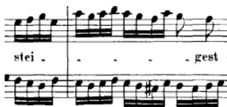
Figure 11. Text painting on steigt in “Auf meinen Flügeln sollst du schweben” from Laßt uns sorgen, laßt uns wachen , BWV 213, by J.S. Bach, mm. 17-18.

Bach used the opening and closing chorus and all of the arias from Laßt uns sorgen, laßt uns wachen in some form in the Christmas Oratorio . “Excepting the final chorus, taken from BWV 184, all the principal numbers of this cantata were incorporated in the Christmas Oratorio .” 168 Terry and Whittaker speculate that Bach was already preparing the Christmas Oratorio and actually borrowed numbers from it, as it had yet to