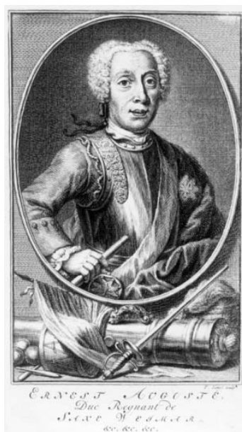
Figure 2. Duke Ernst August of Saxe-Weimar.

two. While Bach was court organist and chamber musician, records show he belonged to the group of “joint servants.” This indicated employment by both dukes, and payment from the joint treasury. 38 Musicians were regarded as servants and Wilhelm had decreed even before Bach’s arrival that members of the court Kapelle were allowed to make music in the Rotes Schloß only with permission from him. 39 Later Wilhelm declared anyone participating in events without his permission was subject to fines and arrest. Somehow Bach managed to elude or ignore all of this, perhaps justifying his attendance at musical events in the Rotes Schloß as a private music instructor to Duke Ernst August (figure 2) and Prince Johann Ernst. 40