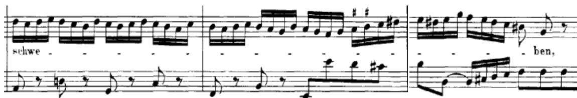
Figure 10. Text painting on schweben in “Auf meinen Flügeln sollst du schweben” from Laßt uns sorgen, laßt uns wachen , BWV 213, by J.S. Bach, mm. 14-16.

including its presentation in the introduction. As in a fugue, all instruments and the voices take turns with the hovering and soaring melody. The intense fugal sound of this aria in a minor key combined with imagery of the flight of the eagle makes this piece interesting and exciting.